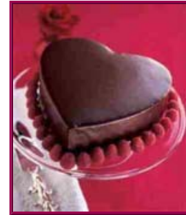
All of us at NATIONAL PARK VILLAGE wish all of you a sweet Valentine's Day!